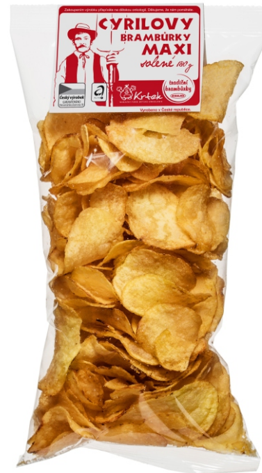
Cyril's potato crisps MAXI 180 g