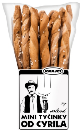
Cyril's mini breadsticks salted 90 g

Gold-baked grissini with coarse salt, caraway seeds or with fried onions go well with beer and also with a glass of wine.