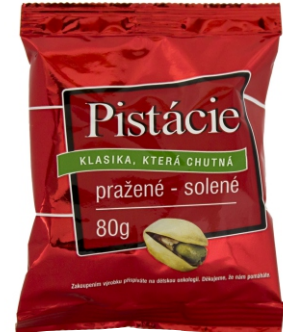
Pistachios 80 g