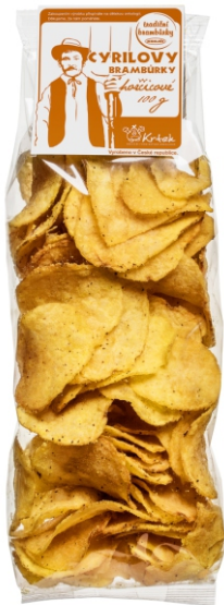
Cyril's potato crisps mustard 100 g