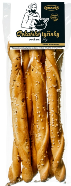
Cyril's breadsticks salted 90 g