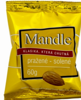
Almonds 60 g