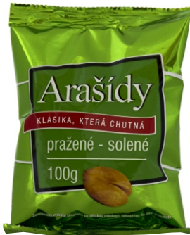
Peanuts 100 g

To complete our portfolio, we also offer roasted nuts. We select high quality nuts for you, pack them in exclusive packaging and deliver them to you.