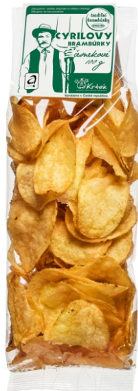
Cyril's potato crisps garlic 100 g