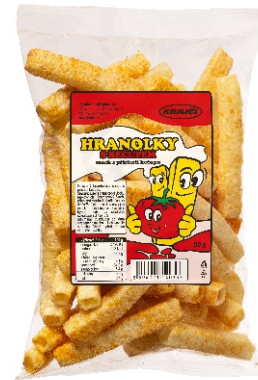
Fries with ketchup 50 g