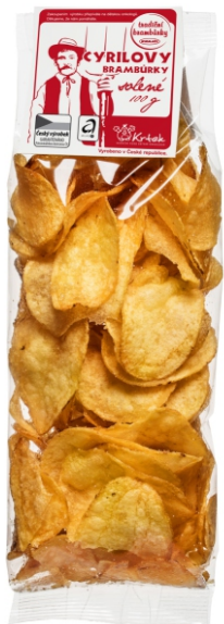
Cyril's potato crisps salted 100 g