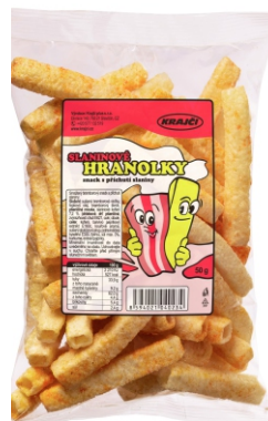
Bacon fries 50 g