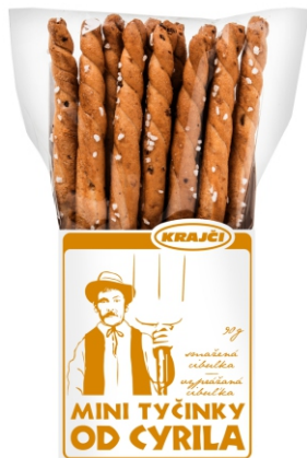
Cyril's mini breadsticks fried onion 90 g