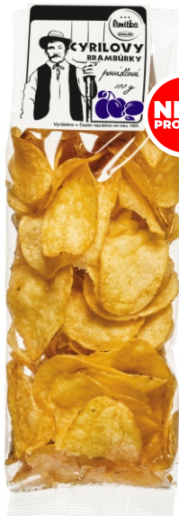
Cyril's potato crisps pepper 100 g