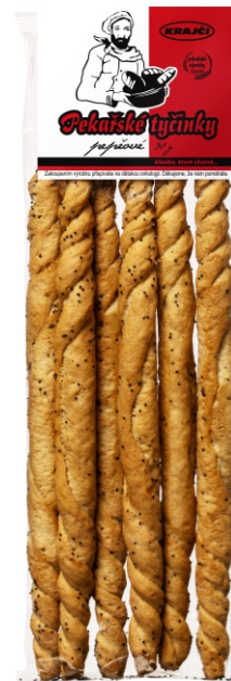
Cyril's breadsticks pepper 90 g