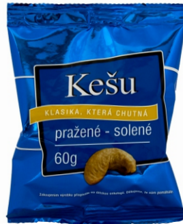
Cashews 60 g