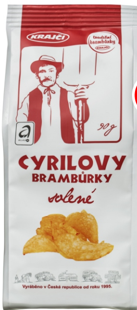
Cyril's potato crisps salted 90 g