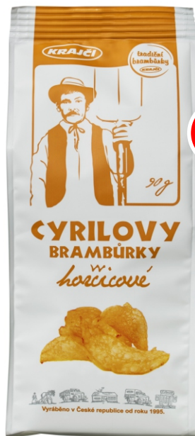
Cyril's potato crisps mustard 90 g