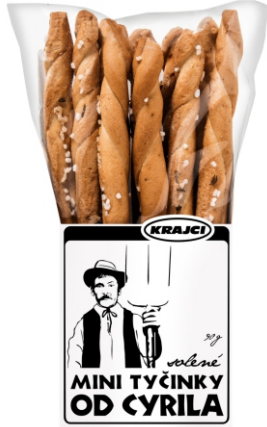
Cyril's mini breadsticks salted 90 g

Gold-baked grissini with coarse salt, caraway seeds or with fried onions go well with beer and also with a glass of wine.