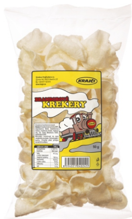
Potato crackers 45 g

Made from potato dough, soft and crunchy, these are our salty snacks in several shapes and flavors. One package is never enough.