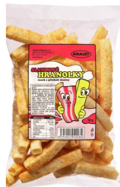
Bacon fries 50 g