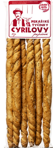
Cyril's breadsticks pepper 90 g