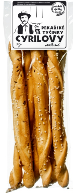
Cyril's breadsticks salted 90 g