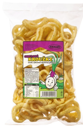
Onion rings spicy 45 g