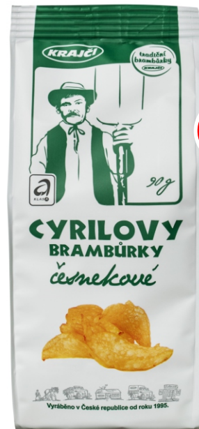
Cyril's potato crisps garlic 90 g