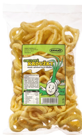
Onion rings 45 g