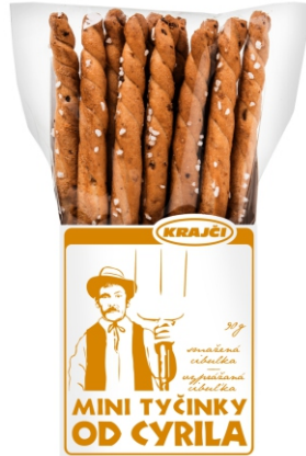
Cyril's mini breadsticks fried onion 90 g